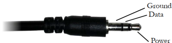
Figure 1: 3.5 mm Stereo Plug

The following software support the EC-5 sensor: